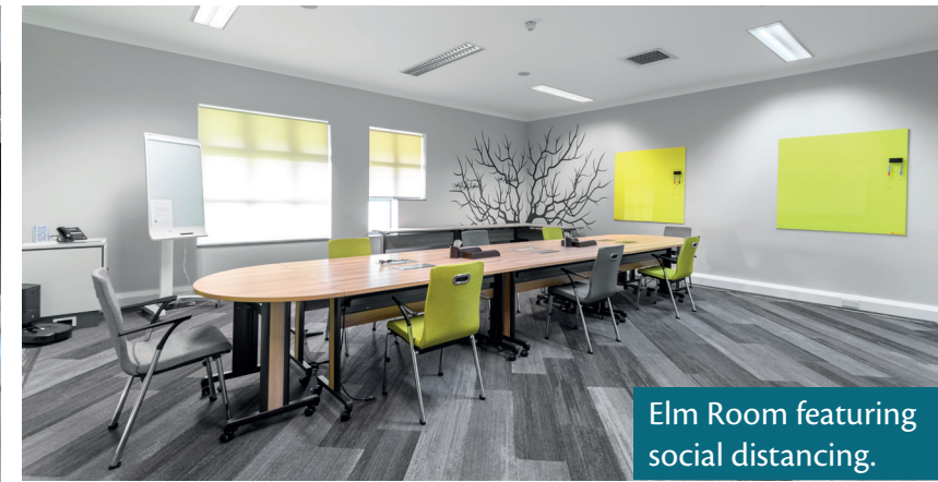
Elm Room featuring social distancing.